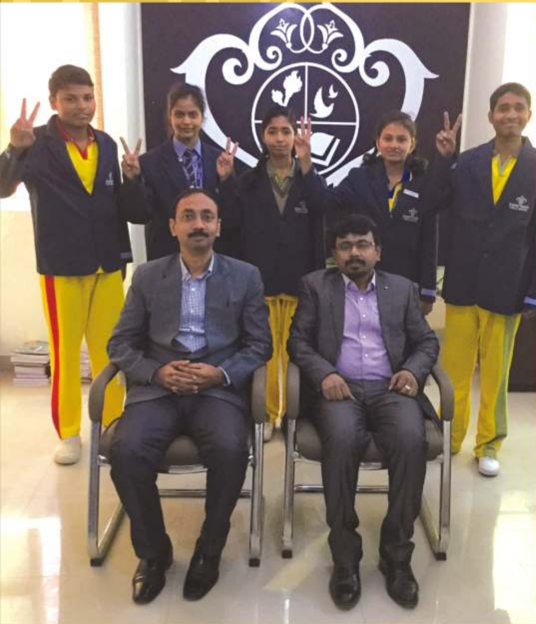
JSO qualified students with Chairman Sir & Director Sir.