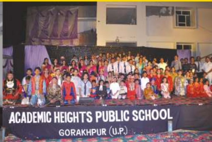
Annual Day Programme.