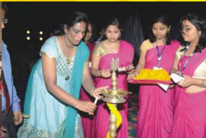
P.T. Usha Inaugurating the school.